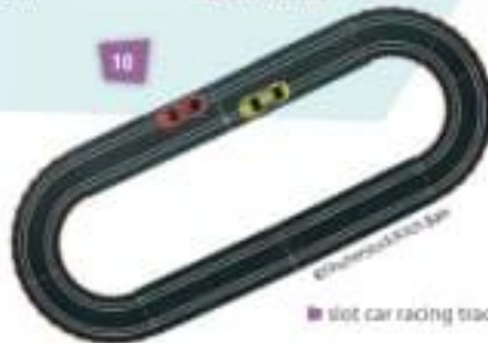
slot car racing track