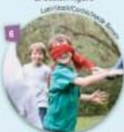
blind man's bluff